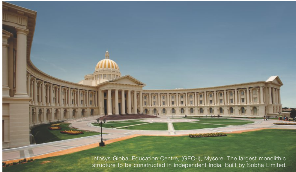
Infosys Global Education Centre, (GEC-I), Mysore. The largest monolithic structure to be constructed in independent India. Built by Sobha Limited.

Such is the craftsmanship and attention to detail of a SOBHA home that it becomes a legacy, an heirloom, a milestone and an exceptional emotional statement. This indisputable standing comes from the consistency with which SOBHA has inculcated its passion for excellence ever since it was founded in 1995. Sobha's in-house expertise, backward integration model and an organization culture of excellence has helped them deliver high quality homes on time, every time.