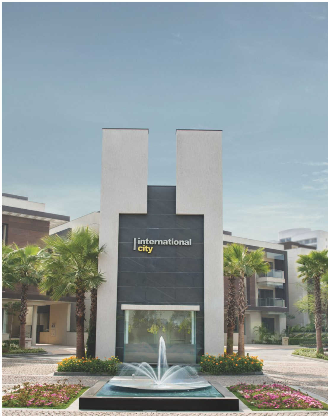
ACTUAL IMAGE OF THE BLOCK B ENTRANCE