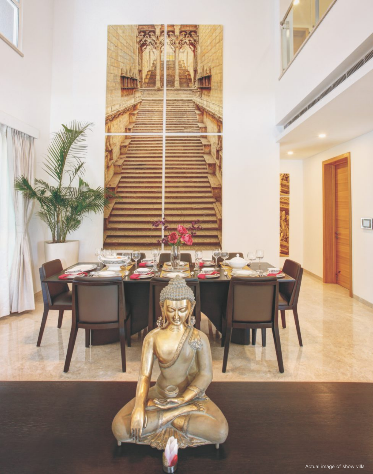
Actual image of show villa