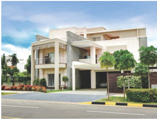
Sobha Lifestyle, Bangalore