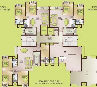
TYPE-4 AREA-1360 Sqft.