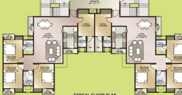
TYPICAL FLOOR PLAN BLOCK - F, G, H, J, K, L, P, Q