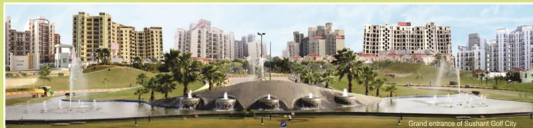
Grand entrance of Sushant Golf City