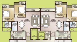
TYPE-4 AREA-1360 Sqft.