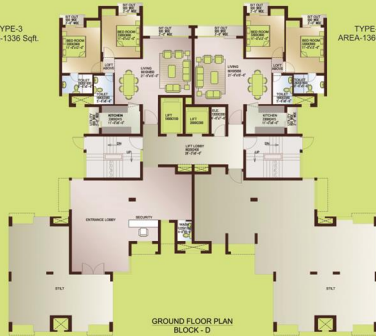
TYPE-4 AREA-1360 Sqft.