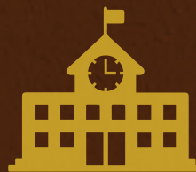
Provision for Pre-school & Nursing Home