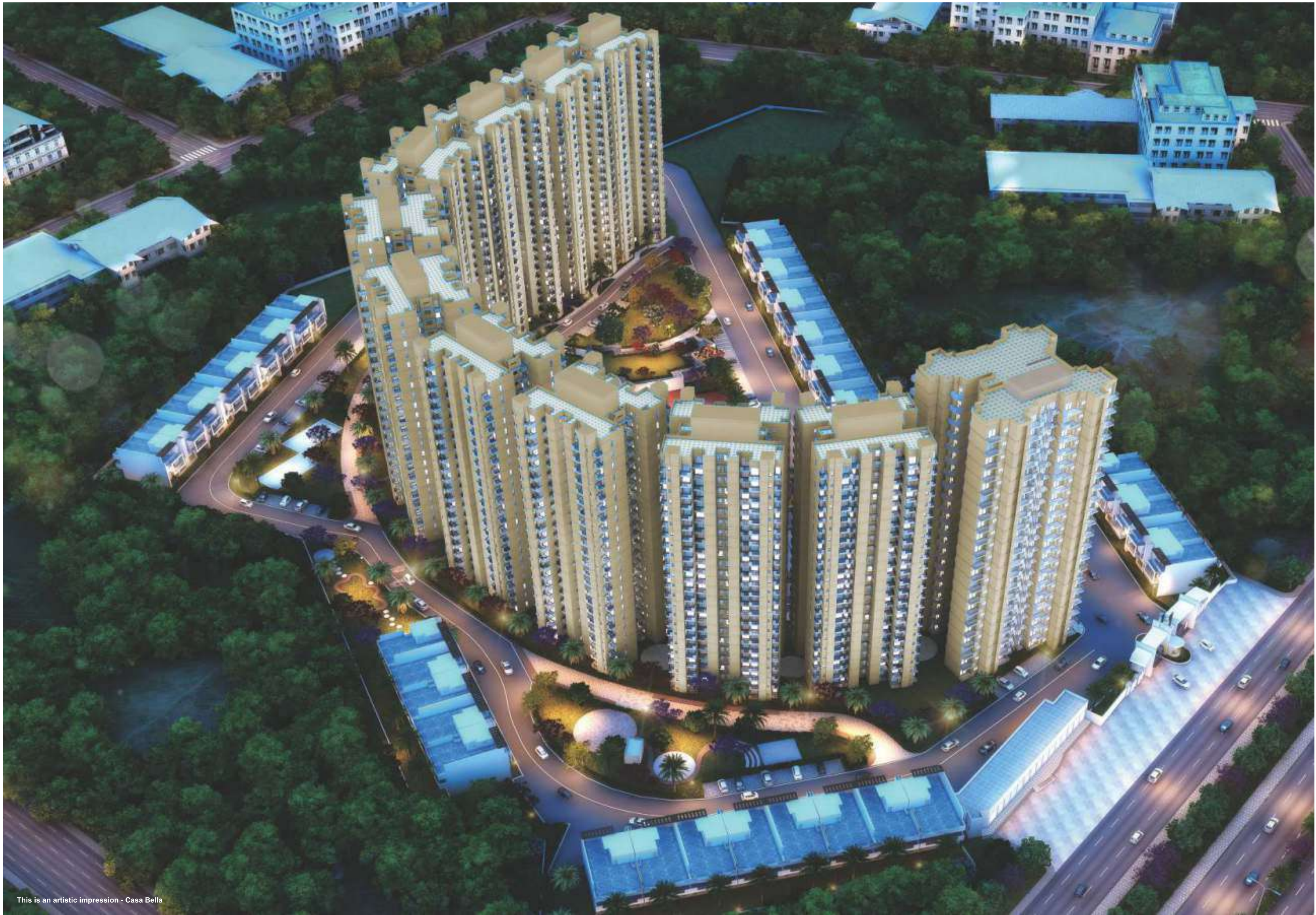
This is an artistic impression - Casa Bella