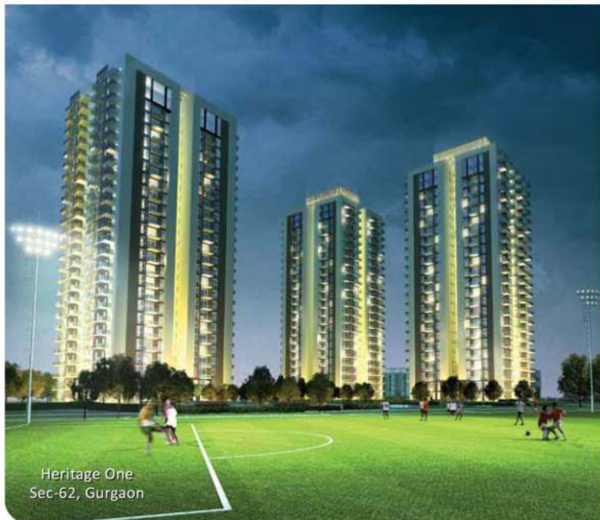
Heritage One Sec-62, Gurgaon