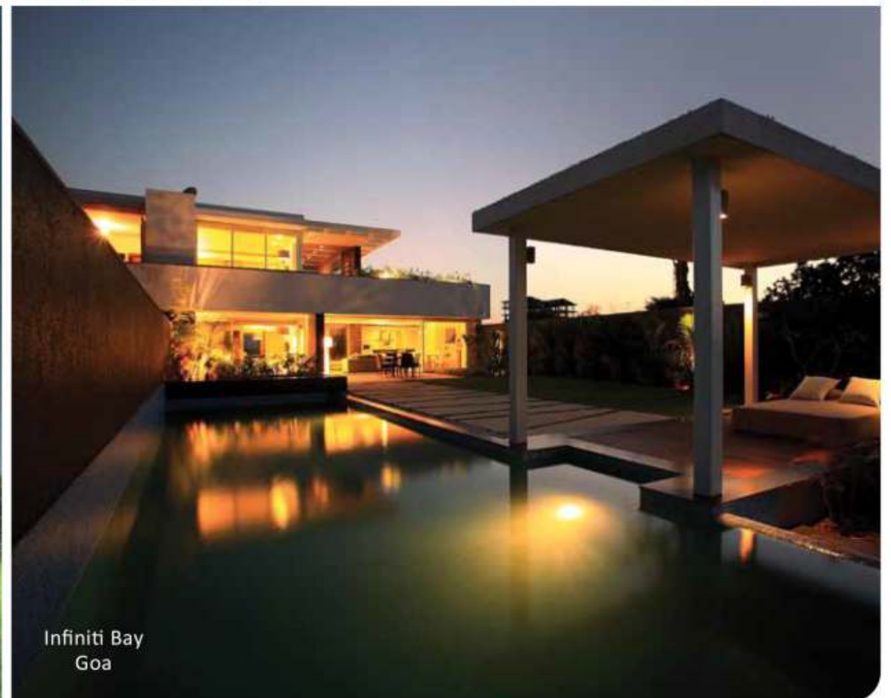
Infiniti Bay Goa