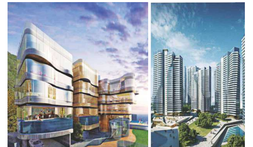
Projects designed by Aedas, Singapore