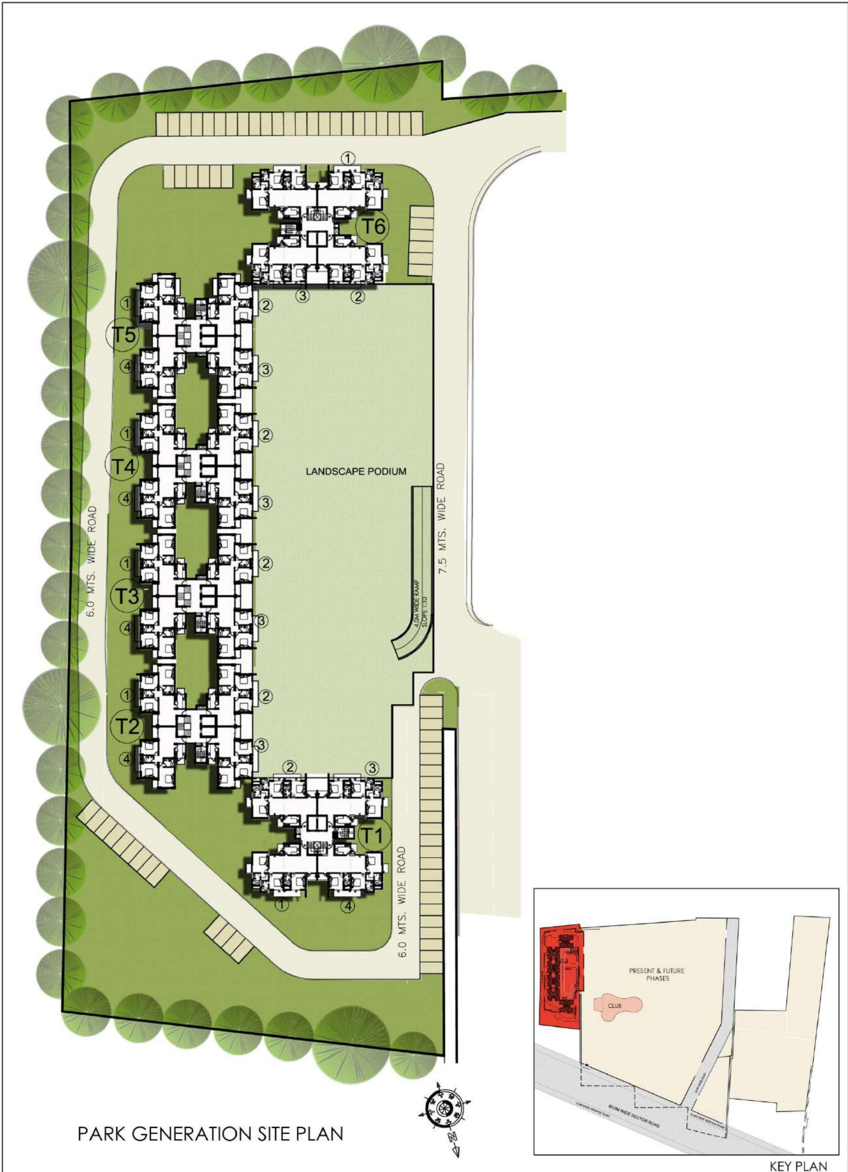
PARK GENERATION SITE PLAN