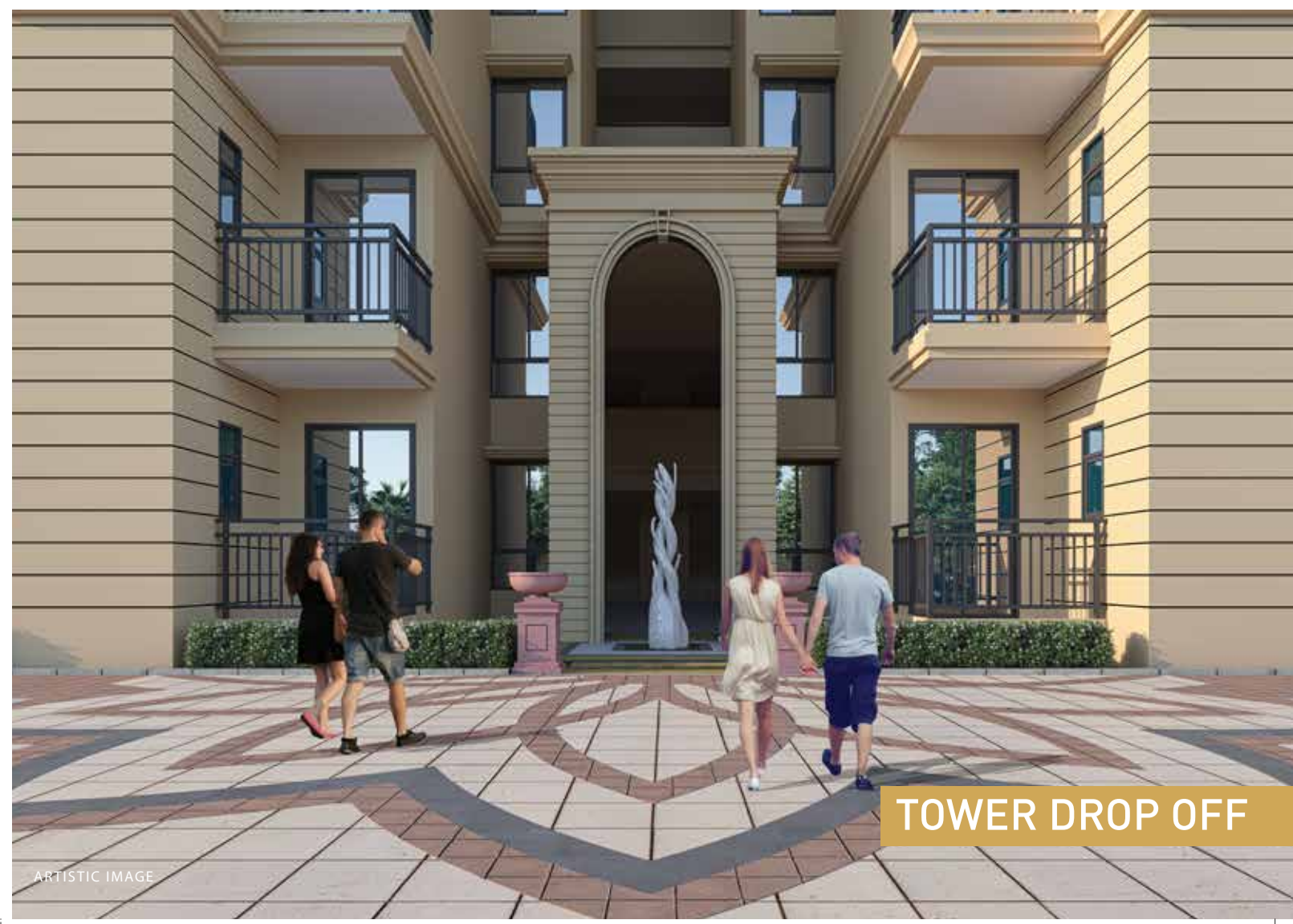
TOWER DROP OFF