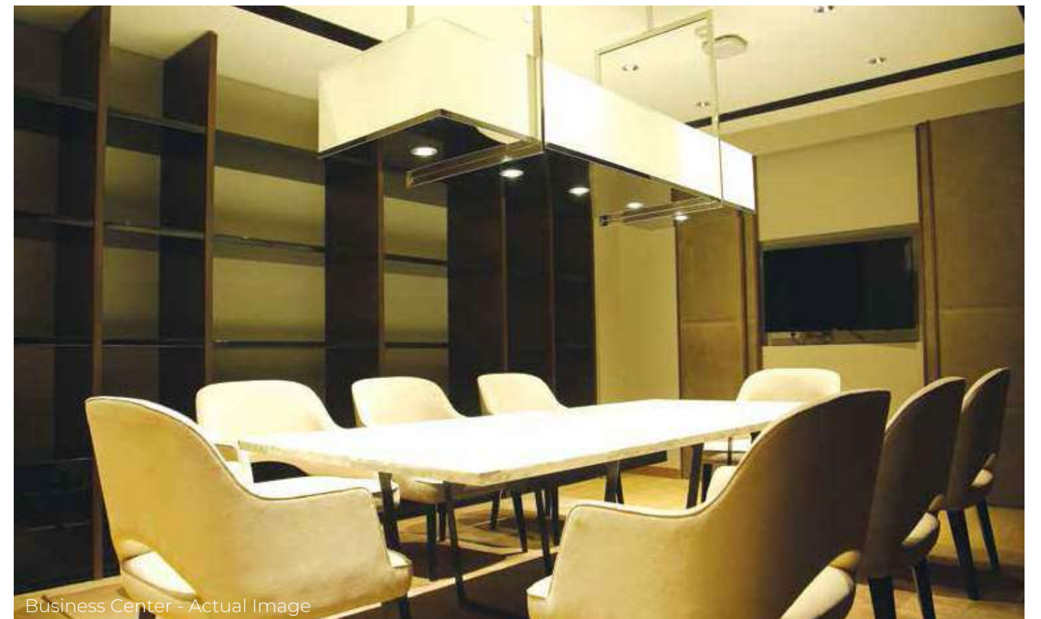
Business Center - Actual Image