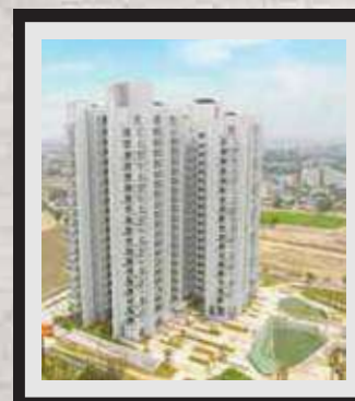
M3M ESCALA SECTOR-70A, GURUGRAM