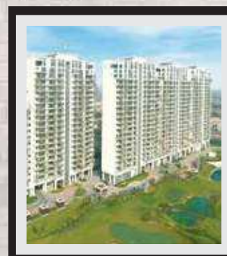
M3M POLO SUITES RESIDENTIAL SUITES GOLF COURSE ROAD EXTENSION SECTOR-65, GURUGRAM