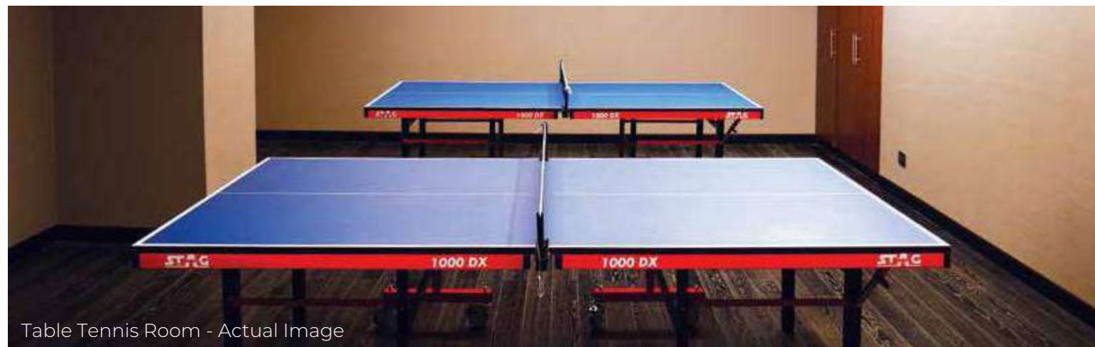
Table Tennis Room - Actual Image