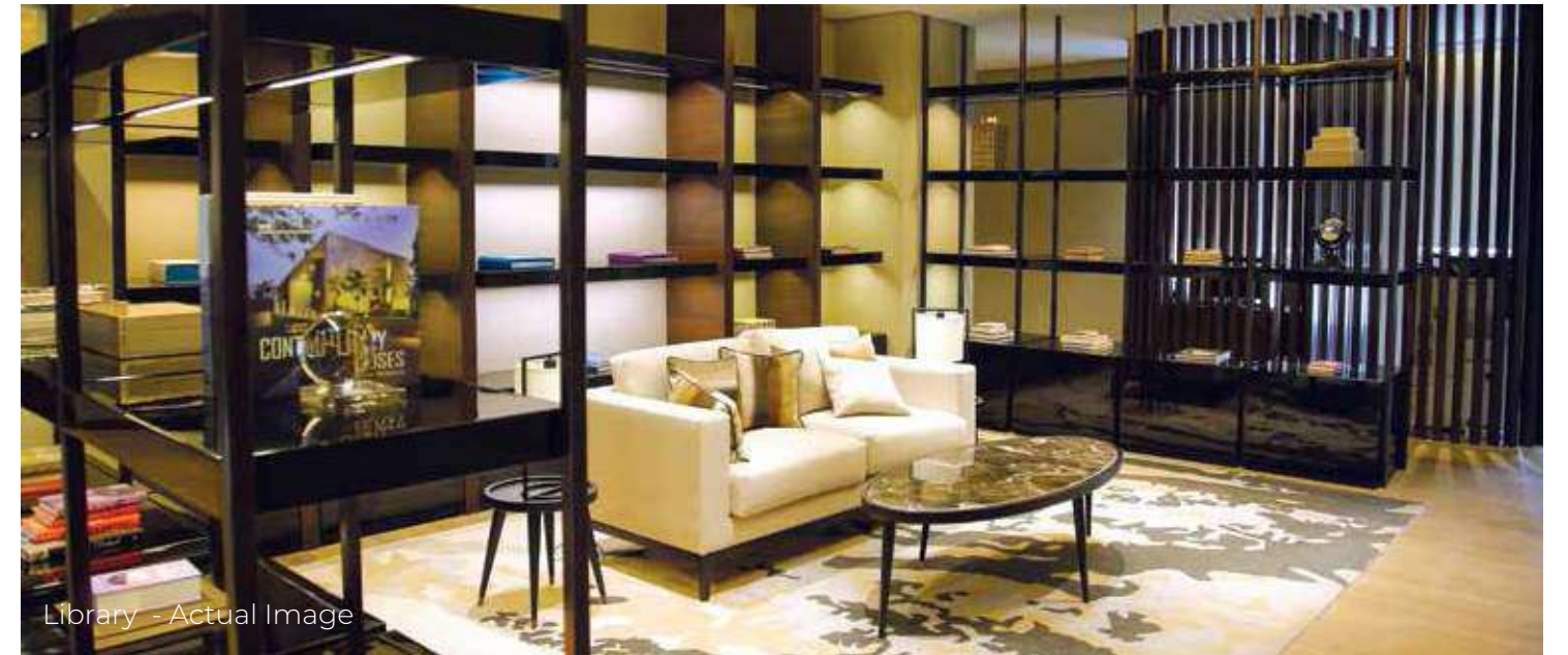
Library - Actual Image