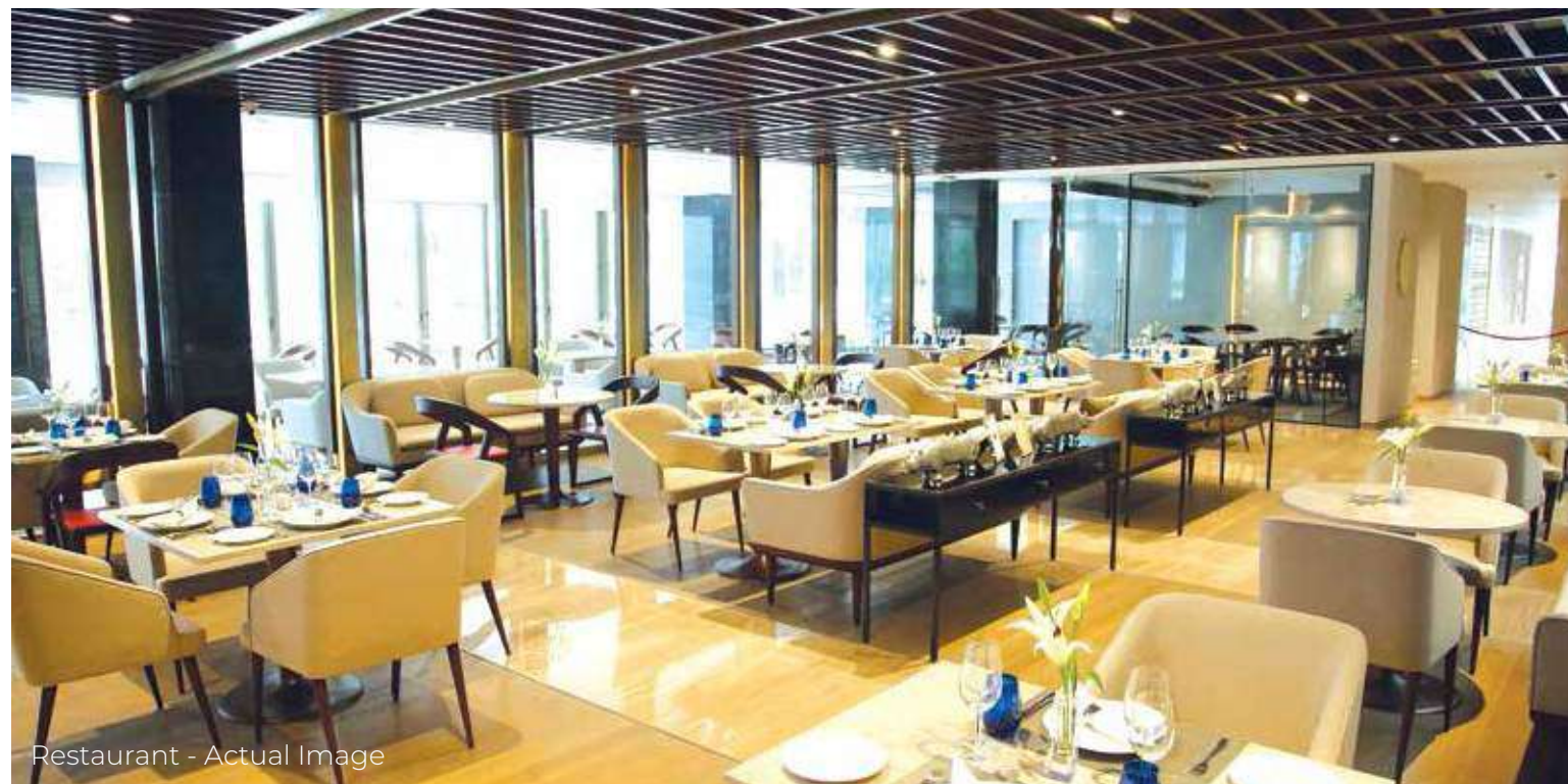
Restaurant - Actual Image

@ THE EXCLUSIVE M3M GOLFSTATE CLUBHOUSE.