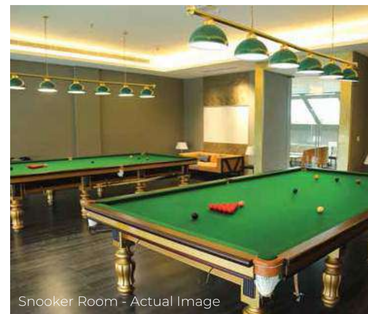
Snooker Room - Actual Image