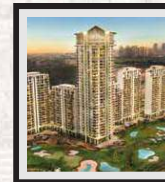
M3M ST. ANDREWS GOLF RESIDENCES SECTOR-65, GURUGRAM