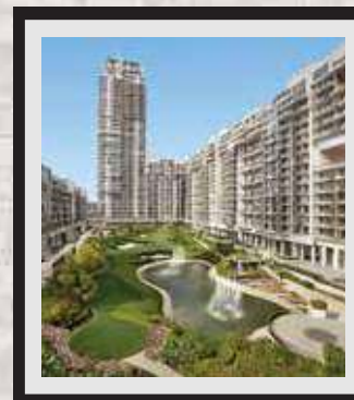
M3M golfestate Fairway GOLF COURSE ROAD EXTENSION SECTOR-65, GURUGRAM

We are proud to say that our professionalism and continued dedication to detail, have earned us the trust of countless families, leading brands and a host of renowned partners. This is the relationship that we cherish and together, we believe in doing what we repeatedly do - creating landmarks beyond beauty and delivering dreams surpassing expectations.