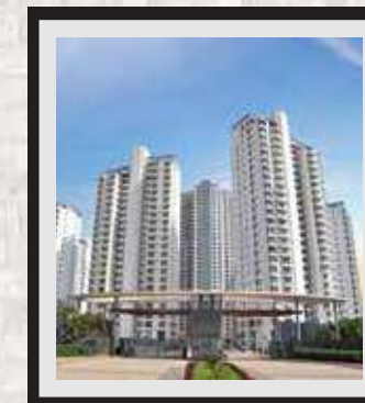
M3M MERLIN SINGAPORE STYLE WORLD-CLASS APARTMENTS GOLF COURSE ROAD EXTENSION SECTOR-67, GURUGRAM