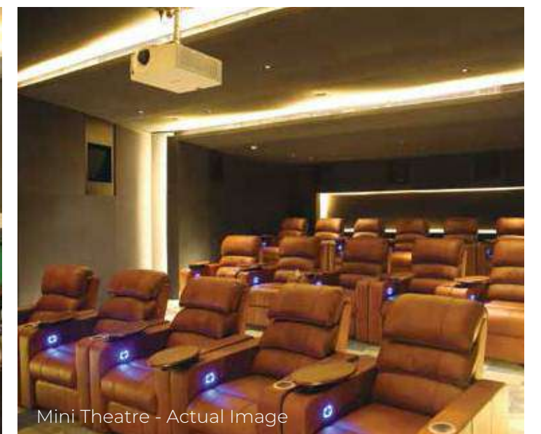
Mini Theatre - Actual Image