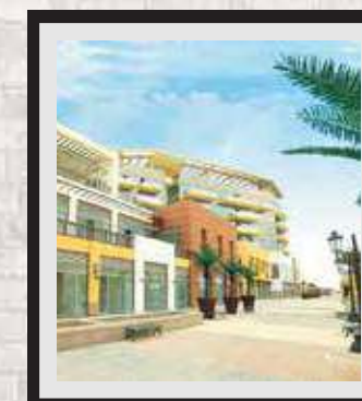
M3M URBANA The Latest in the Evolution of Urban Business & Retail SECTOR-67, GURUGRAM