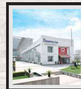
M3M COSMOPOLITAN STYLISH RETAIL & COMMERCIAL HUB SECTOR-66, GURUGRAM