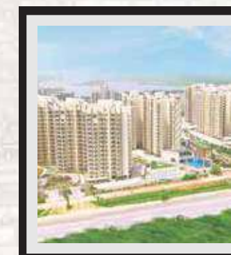
M3M WOODSHIRE SECTOR-107, GURUGRAM