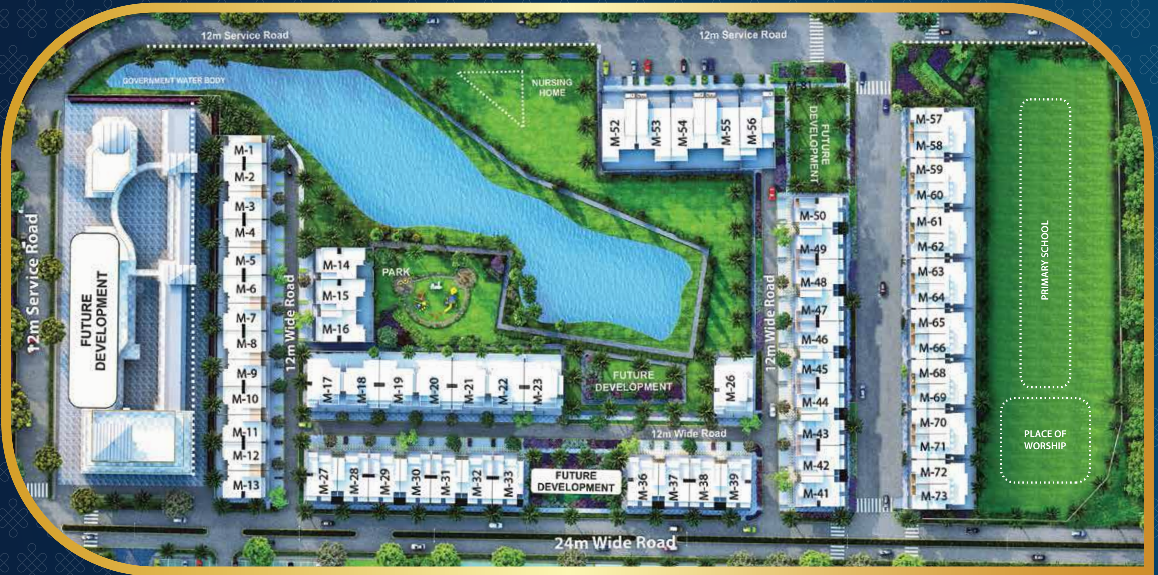
Artist's impression - Not an actual image.

The floors are a small part of the township project licenced by Brahma City Pvt. Ltd. | All infrastructure development will be undertaken by Brahma City Pvt. Ltd. | All 24-metre roads will be open for public access.